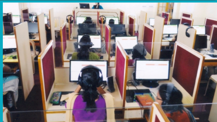
DIGITAL LANGUAGE LAB