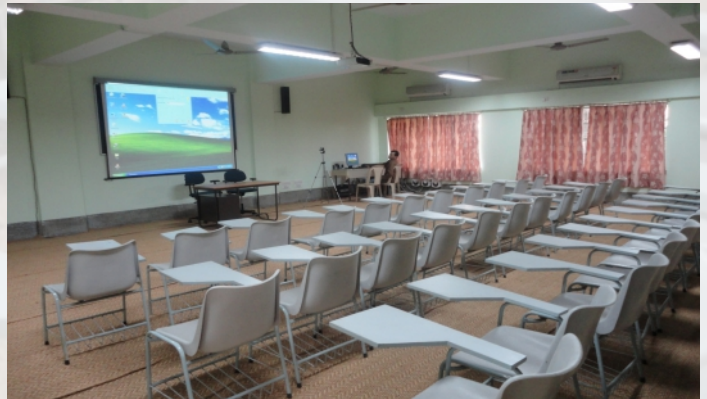
VIDEO CONFERENCING HALL