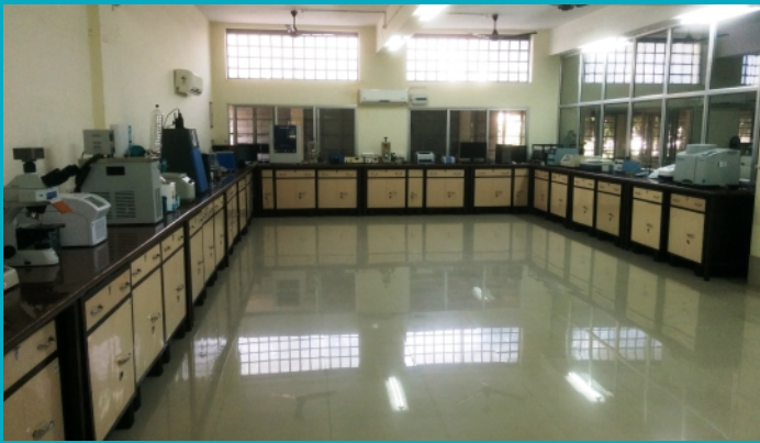
CENTRAL RESEARCH LAB (CRL)