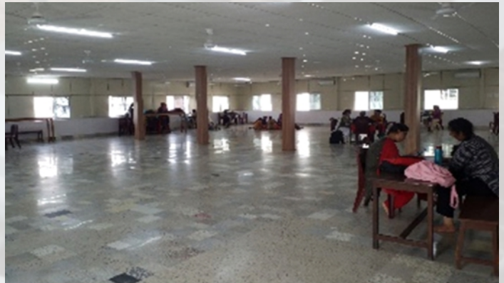
BENEDICTA MEMORIAL STUDY HALL