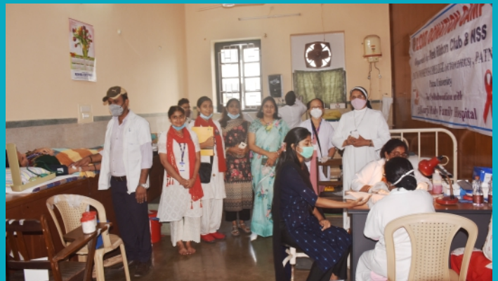
HEALTH CARE CENTRE