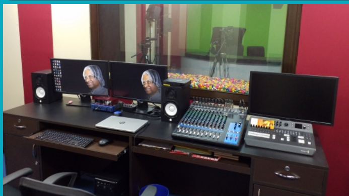
A.V. LAB & E-CONTENT DEV. CENTRE