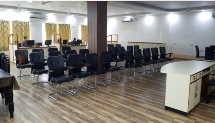
MOTHER VERONICA EXCELLENCE AND INNOVATION CENTRE