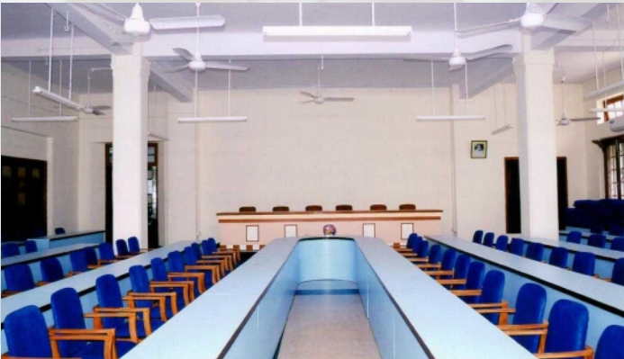
LUCILE MEMORIAL HALL