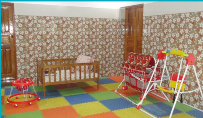
CRECHE AND DAY CARE CENTRE