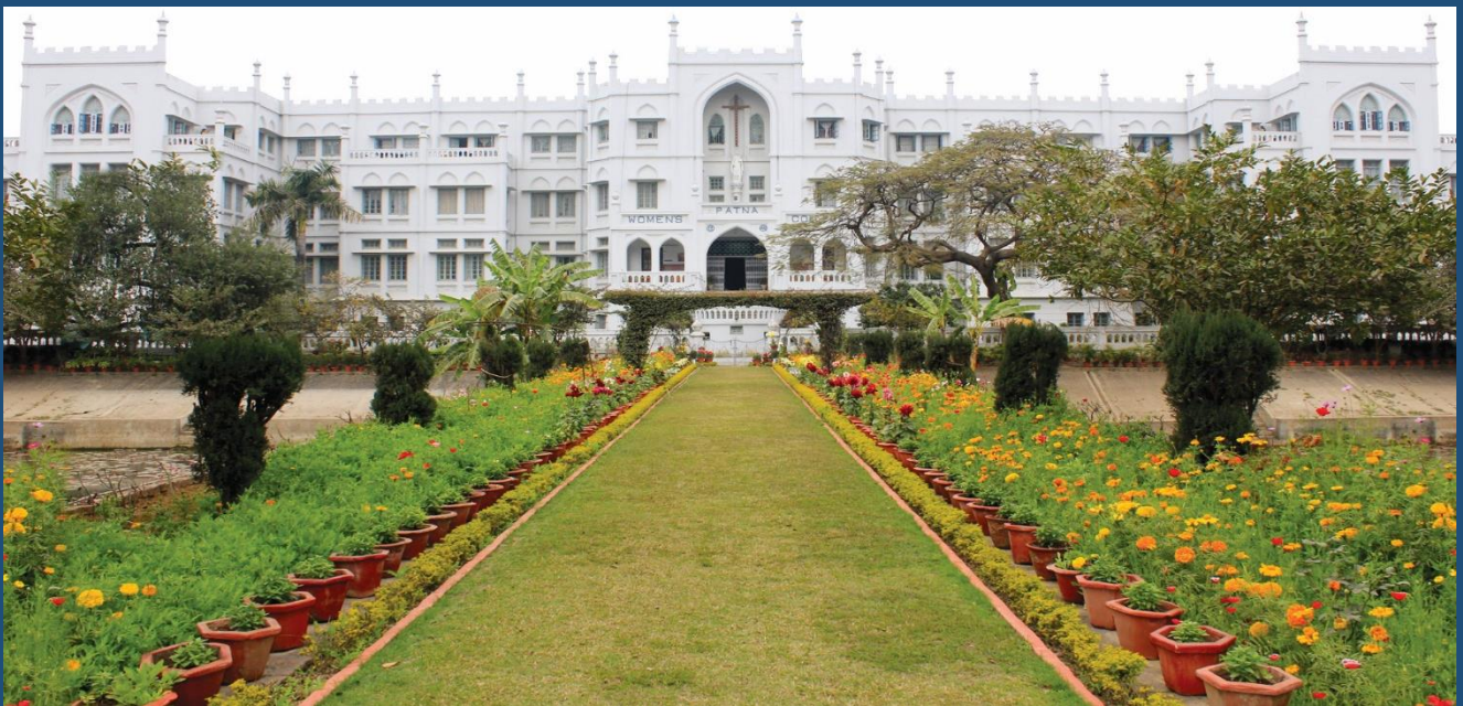
PATNA WOMEN'S COLLEGE MAIN BLOCK