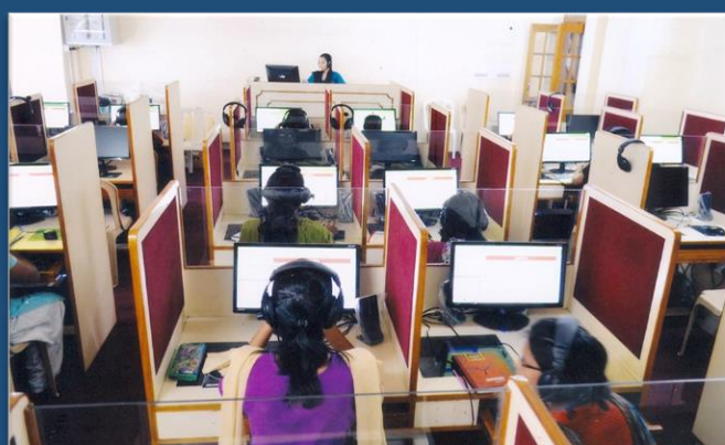
DIGITAL LANGUAGE LAB