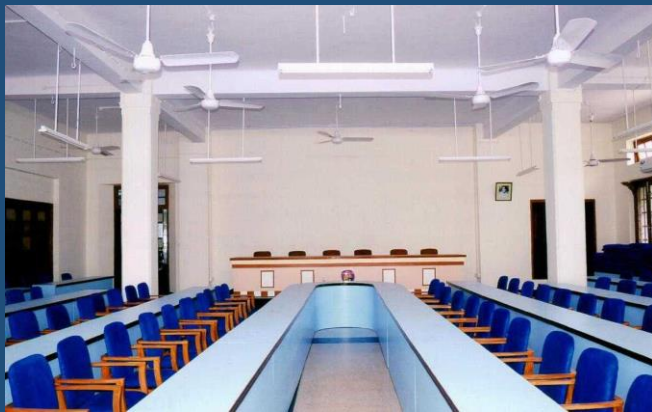
LUCILE MEMORIAL HALL