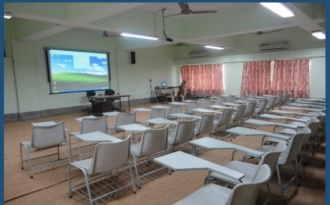
VIDEO CONFERENCING HALL