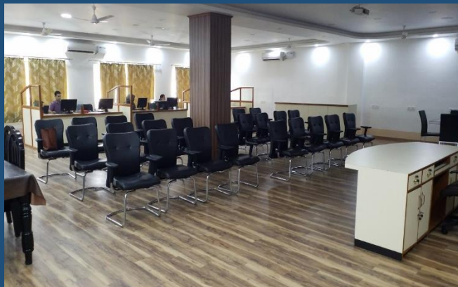
MOTHER VERONICA EXCELLENCE AND INNOVATION CENTRE