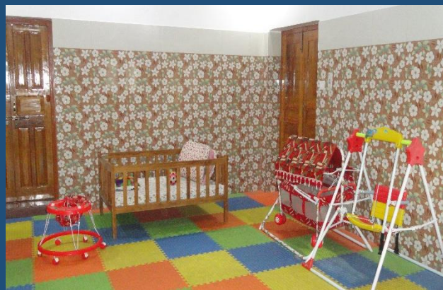
CRECHE AND DAY CARE CENTRE