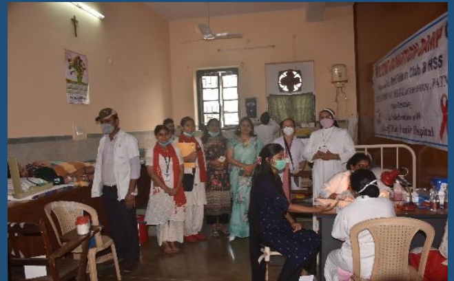
HEALTH CARE CENTRE