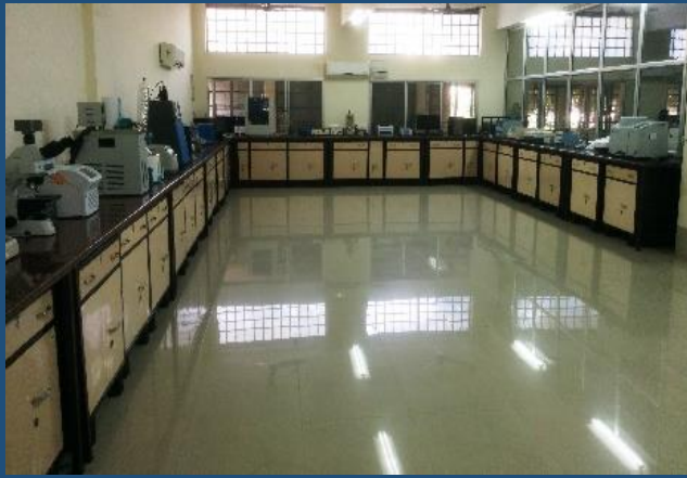
CENTRAL RESEARCH LAB (CRL)