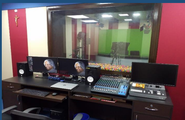
A.V. LAB & E-CONTENT DEV.CENTRE